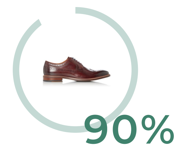
By 2025, 75 % of footwear and accessories will use materials which are recycled, responsibly sourced or from renewable sources